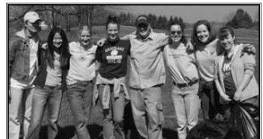
Marquette clean-up day.